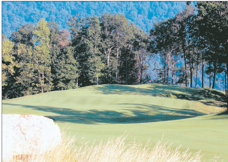
Rock out-croppings and native fescue grasses add to the drama of the downhill approach shot on the first hole.