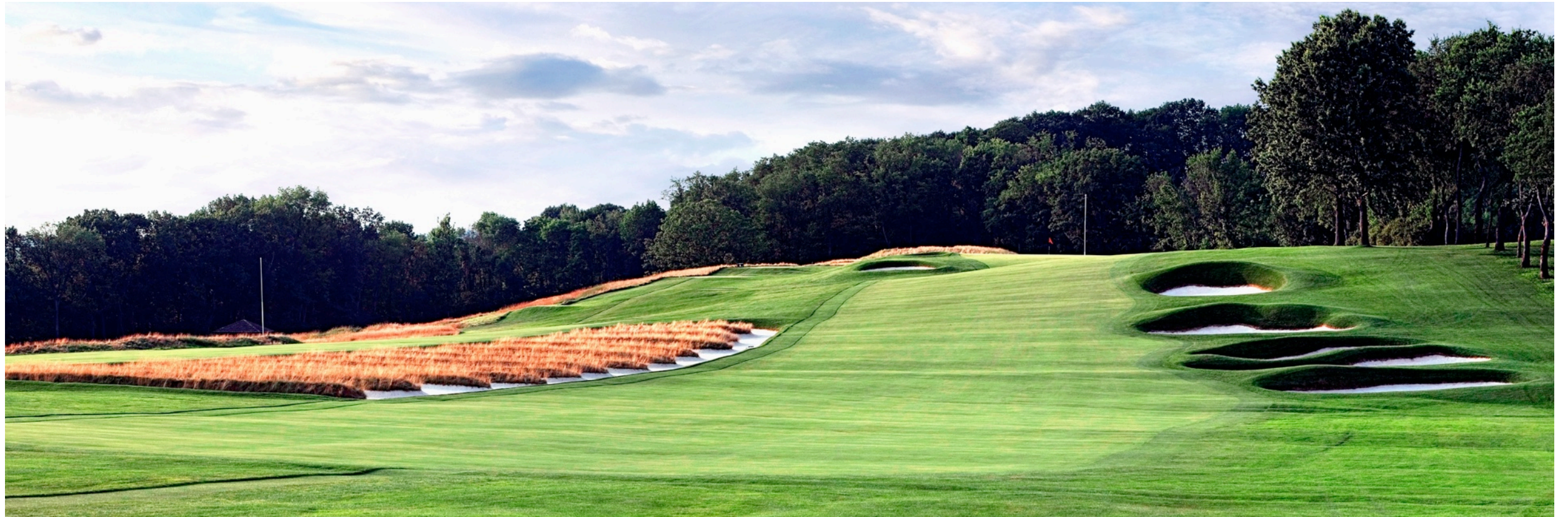
The iconic Church Pew bunkers on hole 3 in 2007

As a crucial part of a 20-year restoration plan, Oakmont removed more than 12,600 trees in what will long be regarded as one of the most definitive architectural renaissances in history. The USGA Architecture Archive, the world's primary digital repository of historically significant materials on golf course architecture, offers a glimpse at this evolutionary transformation through the following photo album.