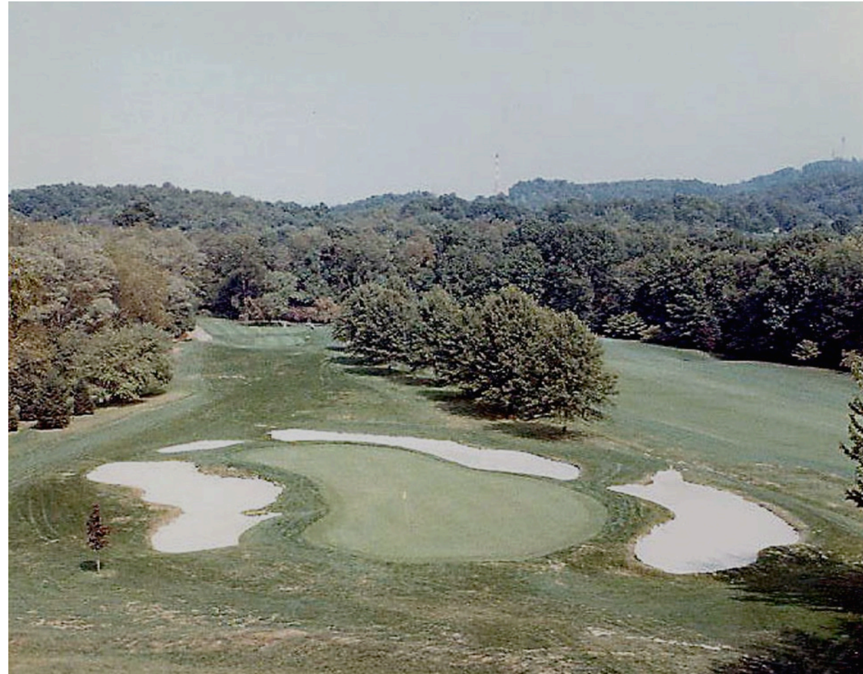
Holes 12 and 13 remained buffered by a row of tree plantings in 1983