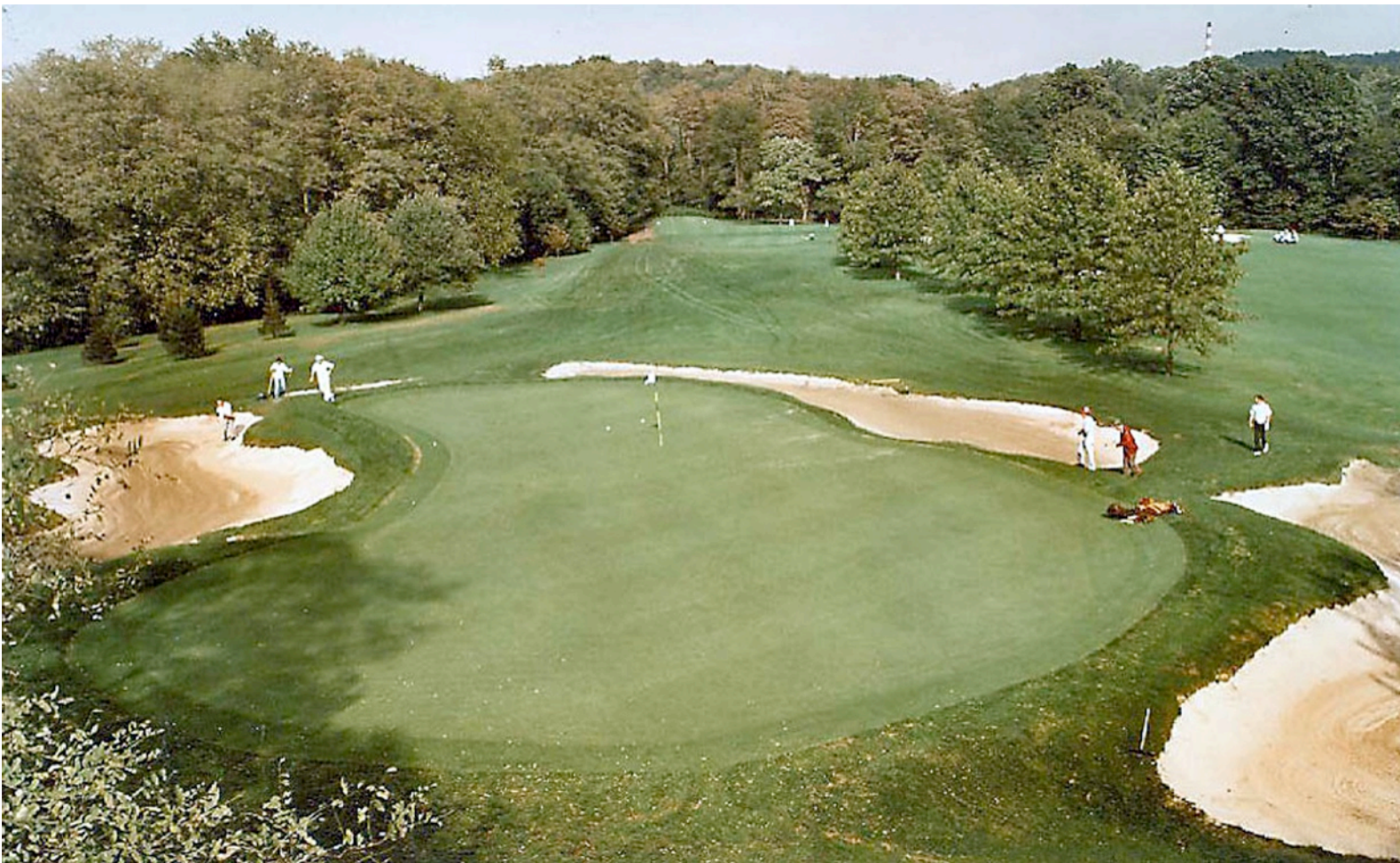
Holes 12 and 13 were divided by a row of tree plantings in 1978