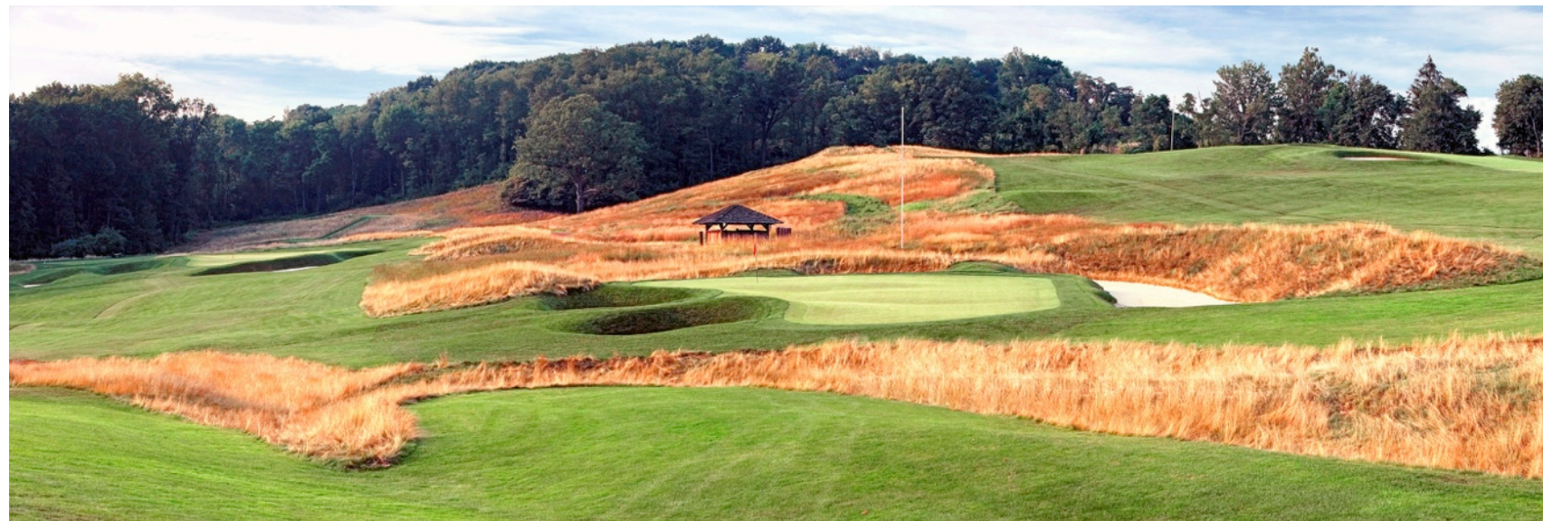
Sweeping view of holes 5 and 6 in 2008