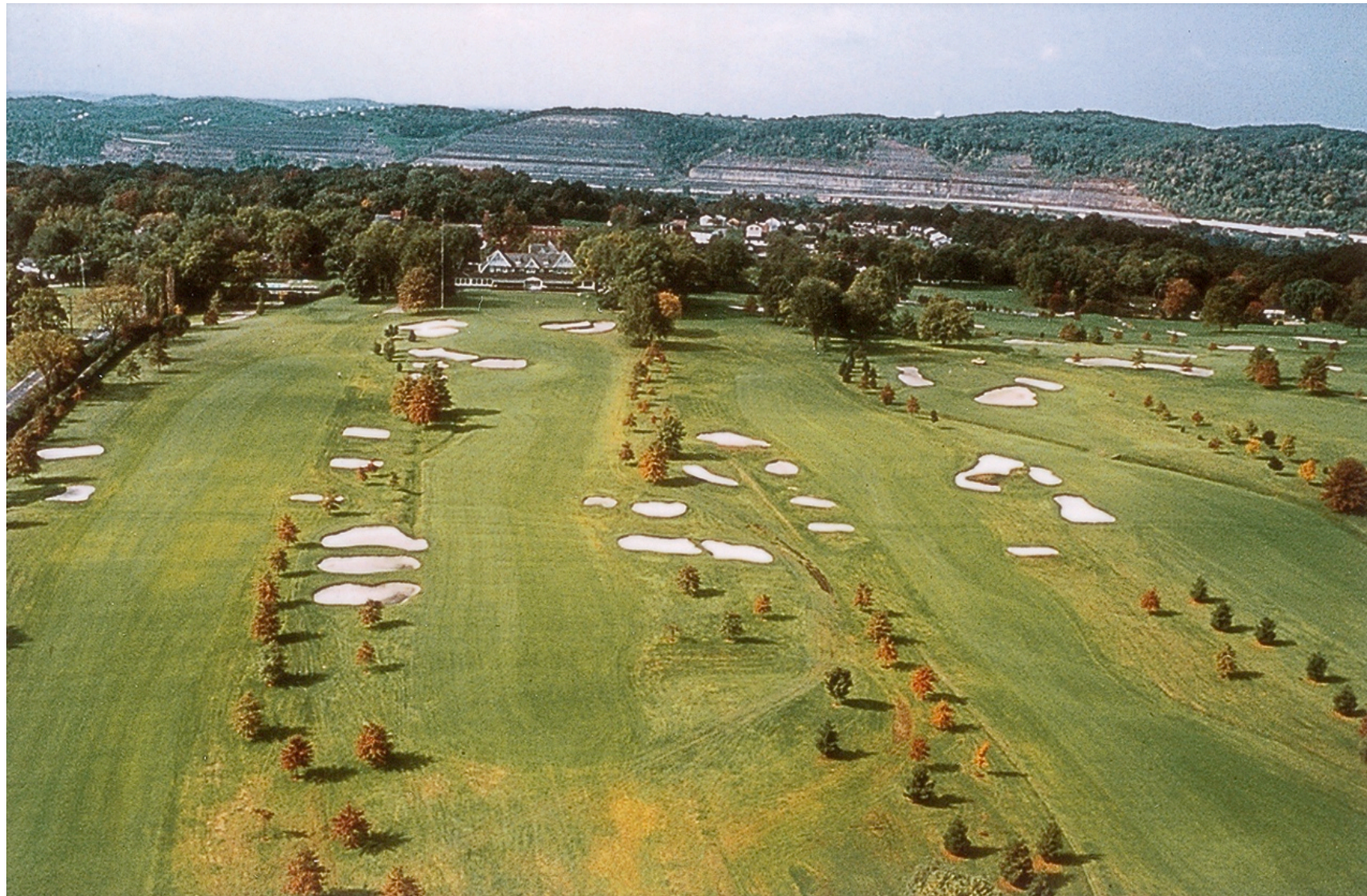
From left to right, hole 1, hole 9, hole 10 and hole 11 in 1973

The post-Fownes' era coincided with the emergence of a nationwide tree-planting trend. Oakmont was among hundreds of golf clubs that utilized trees to enhance the golf course aesthetic. Oakmont officials planted thousands of ornamental saplings between most every hole on the golf course. At the 1973 U.S. Open Championship, Oakmont's official press release revealed that 3,200 trees had been added to the golf course.