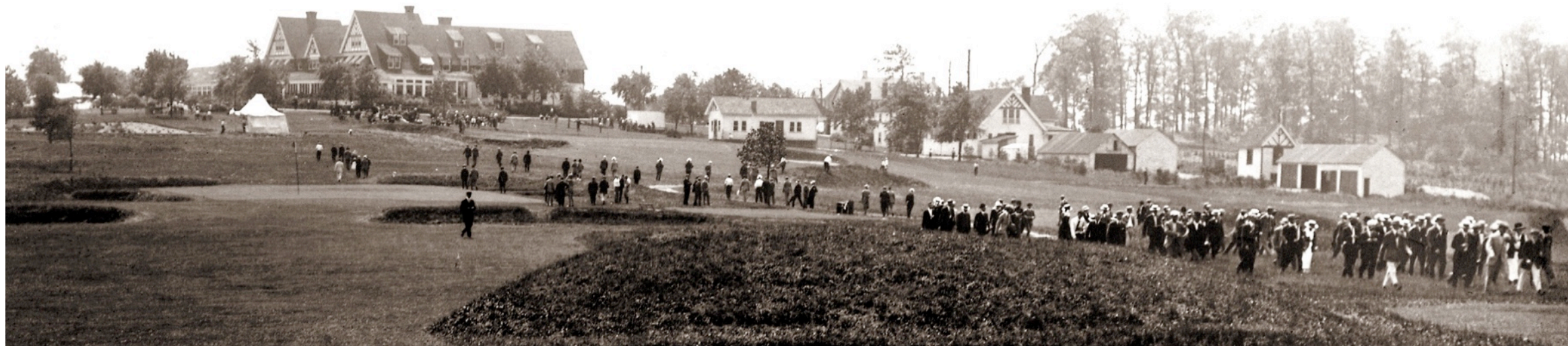
Hole 14 in 1927 with the clubhouse standing prominently in the backdrop of the hole