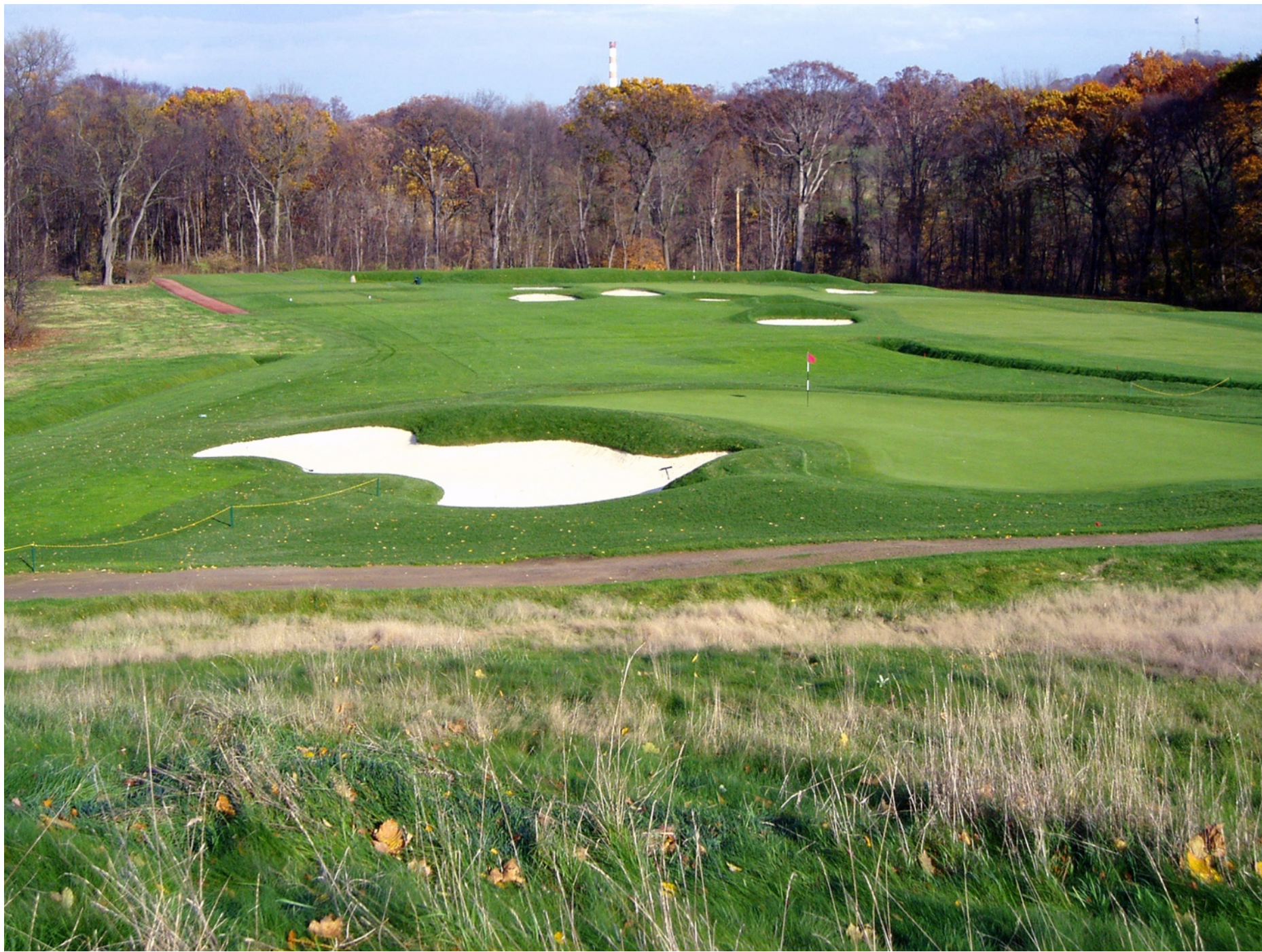
The restored view of Holes 12 and 13 in 2005