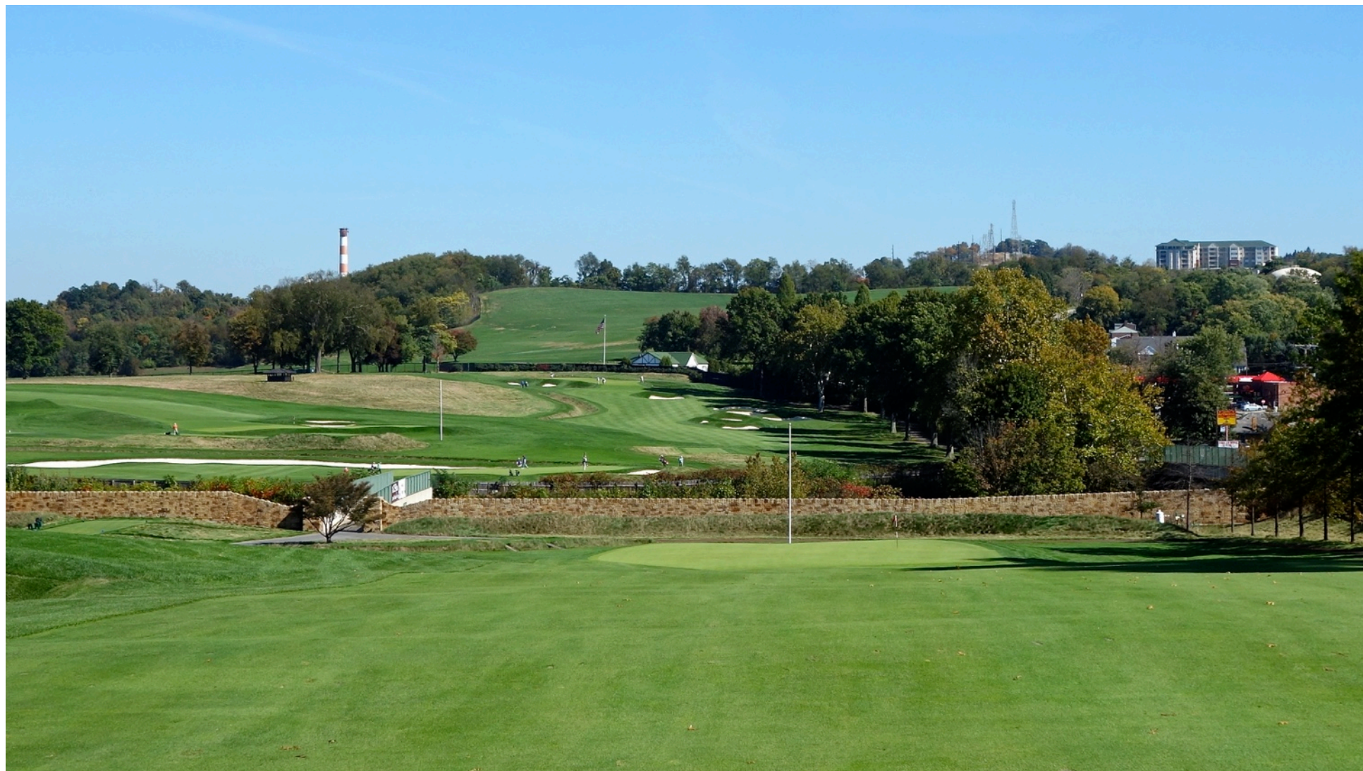
Hole 1 and the Turnpike wall are in the foreground, while Hole 2 and the east part of the golf course are now visible in the distance