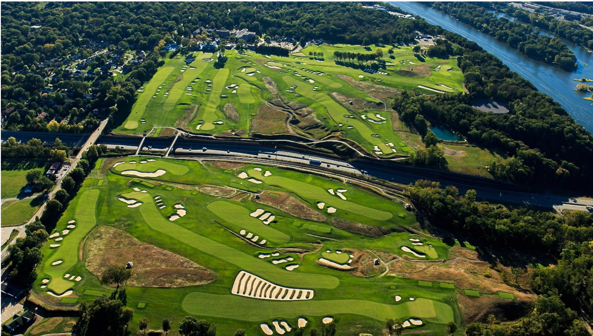
A 2016 Aerial Photo

Today Oakmont continues to play a crucial role to stand as a definitive example of restorative tree management. From start to finish, this was a monumental undertaking and perhaps one the grandest gifts to the discipline of golf course architecture in America.