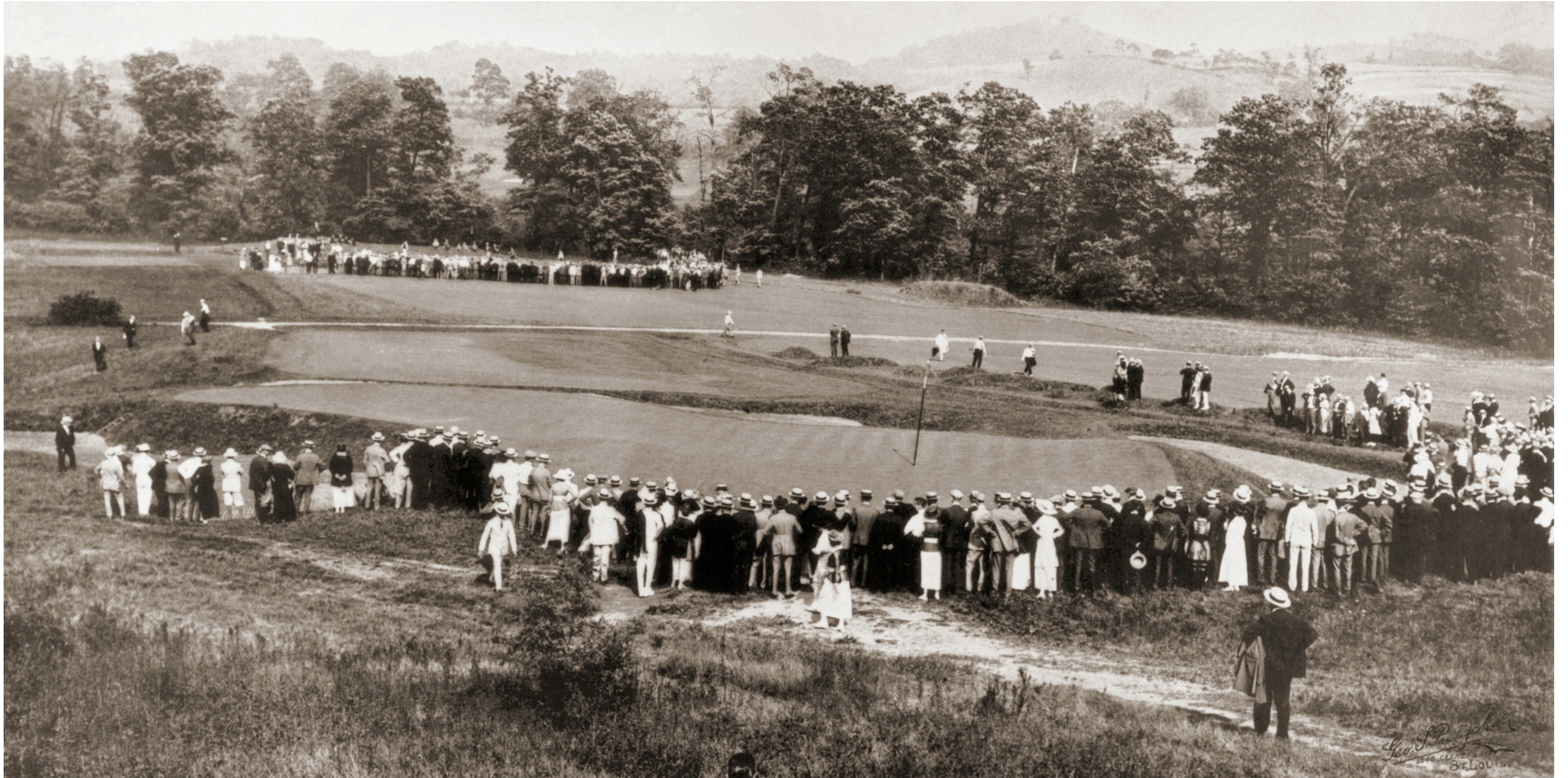
Crowds gather around hole 12 green (background) and hole 13 green (foreground) during the 1927 U.S. Open