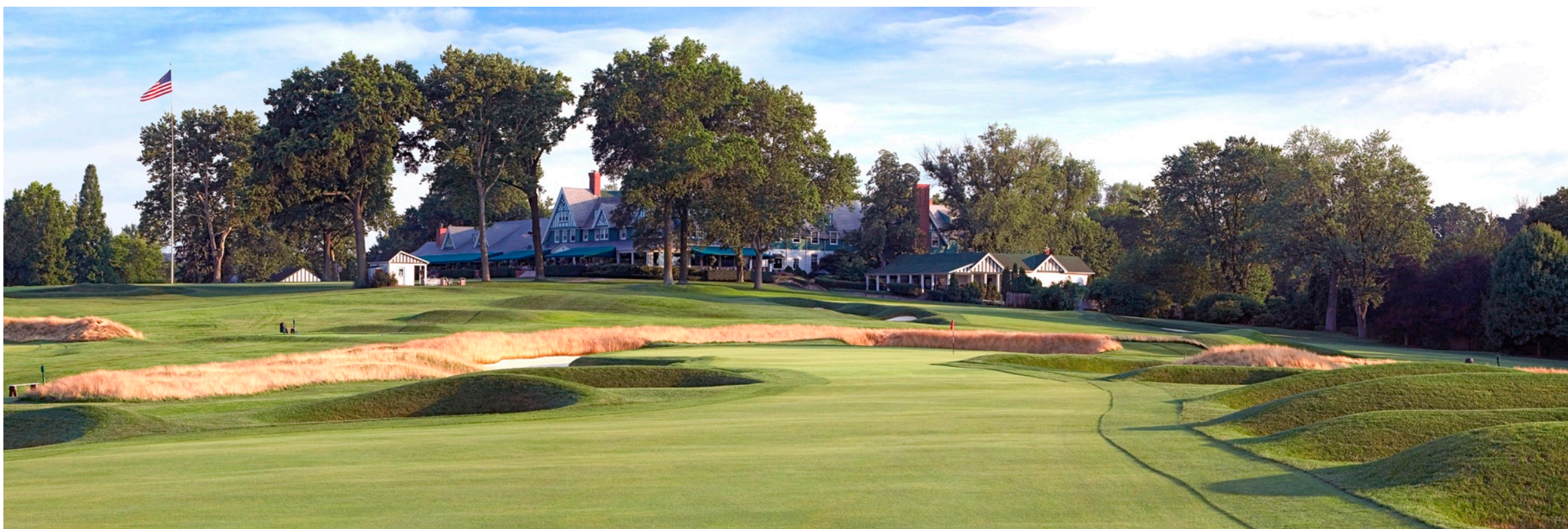
Hole 14 restored in 2007