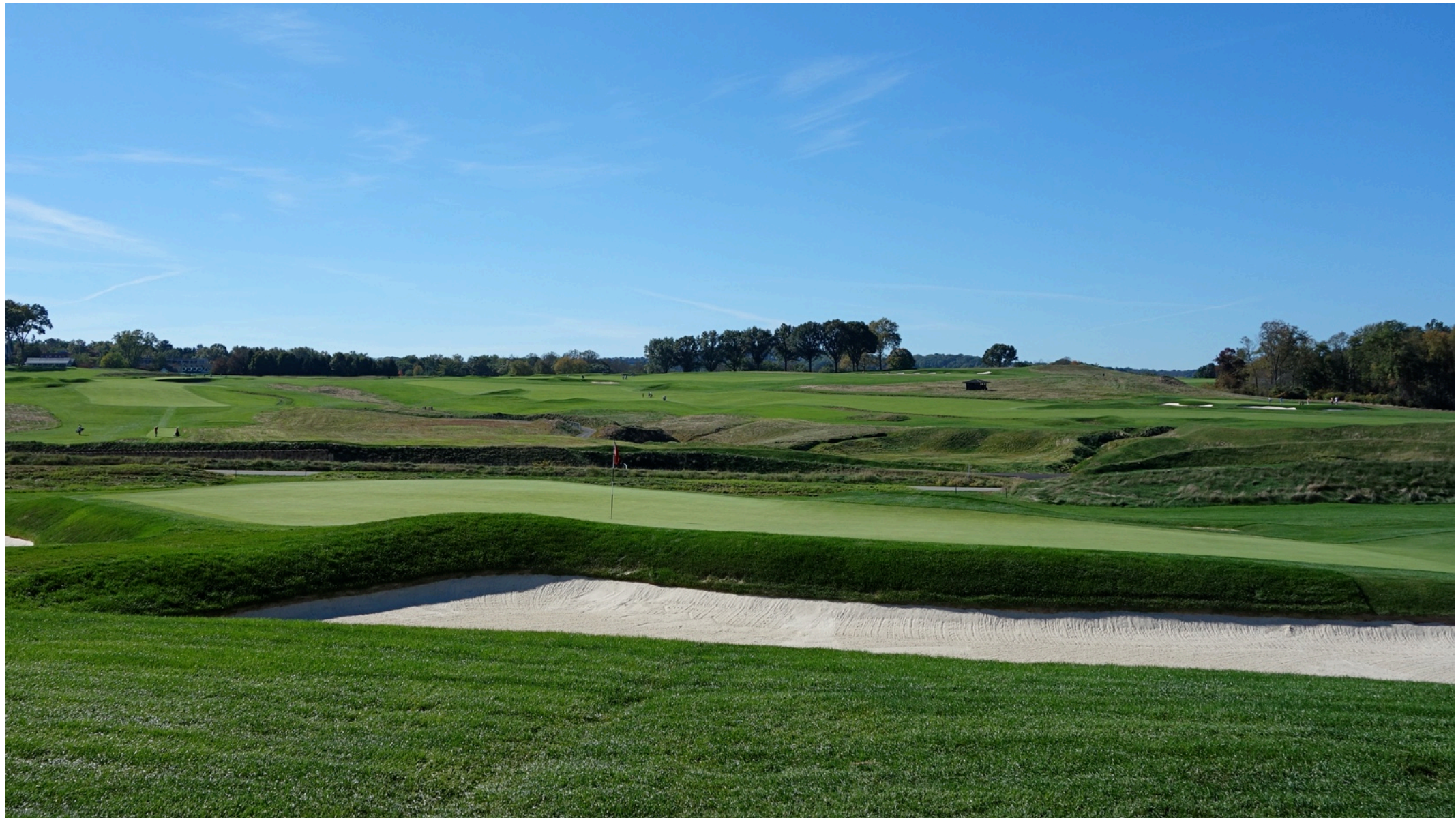
Looking back across the Turnpike at hole 12 from hole 7 green

In preparation for the 2016 U.S. Open Championship, Zimmers and McCormick also removed a large stand of approximately 4,000 trees to the right of hole 12, which opened up views of holes 6 and 7 across the Turnpike.