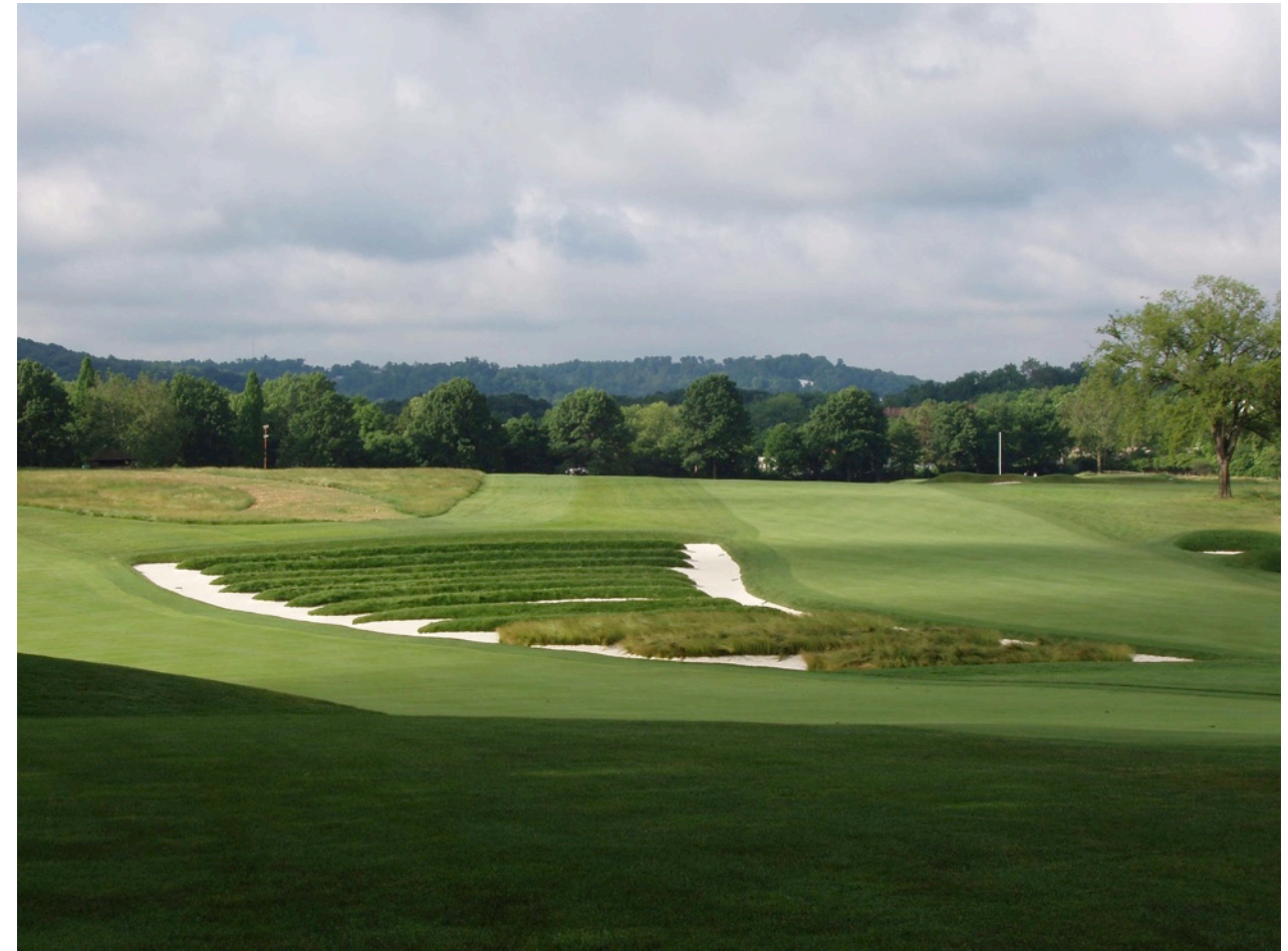
Hole 4 in 2005