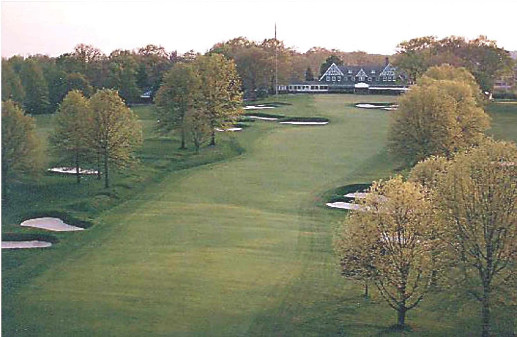
Hole 9 in 1983

In the 1980s, Oakmont hardly resembled its original identity. A vertical framework of trees flanked each hole. Fairway corridors shrunk, and tree shade promoted softer conditions. Golfers, who once enjoyed long sweeping vistas could no longer see from one hole to the next.