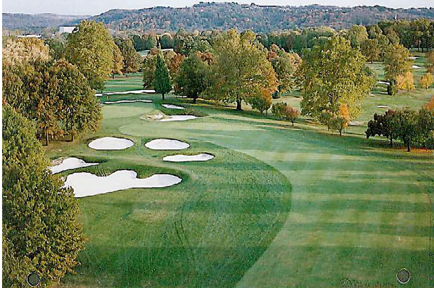
Hole 17 in 1992