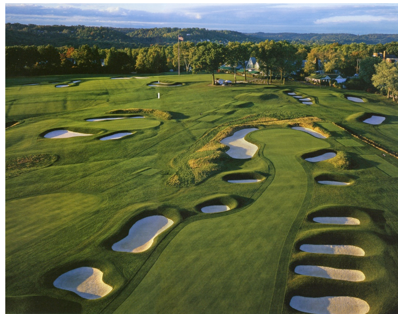
Hole 14 restored in 2007