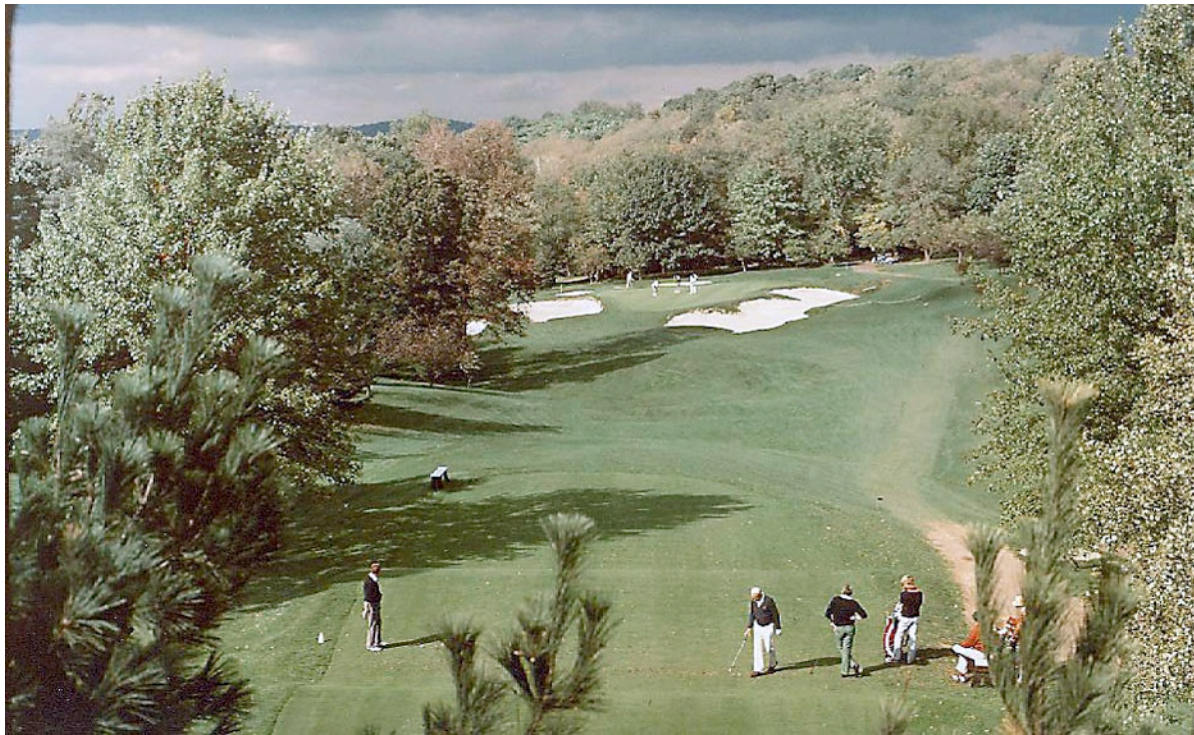
Hole 6 was girdled by vegetation in 1978