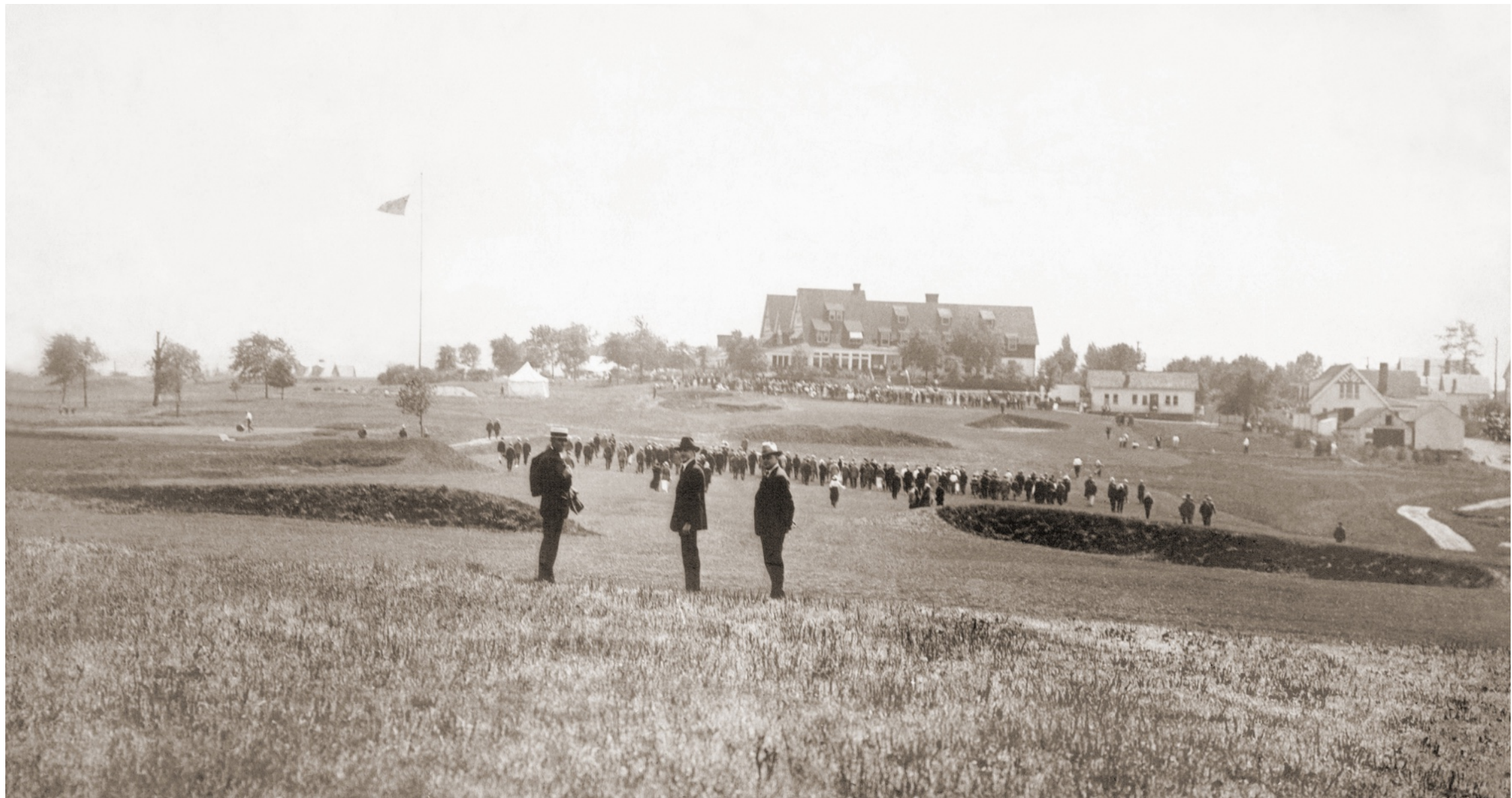
A panoramic view of hole 18 during the 1927 U.S. Open