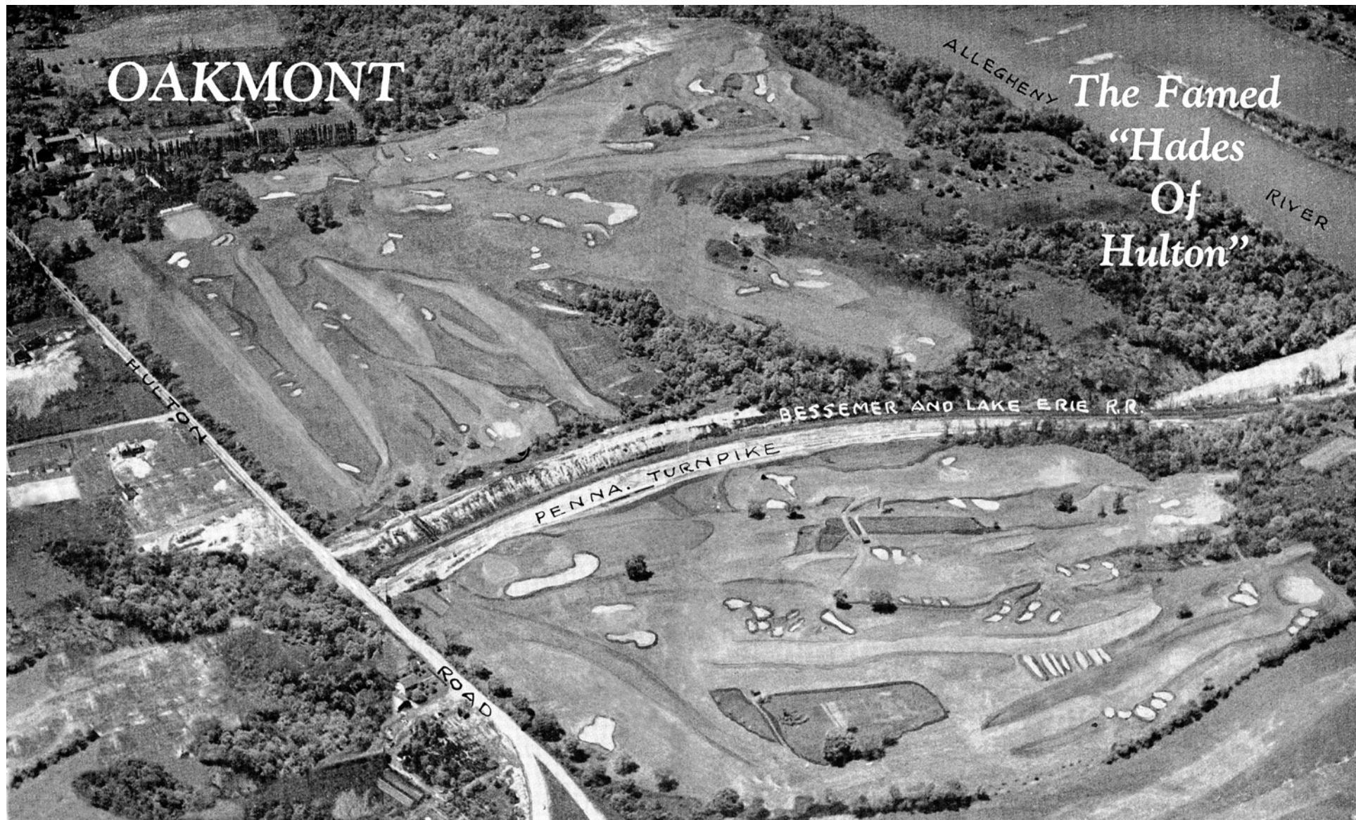
1950 Aerial Photograph