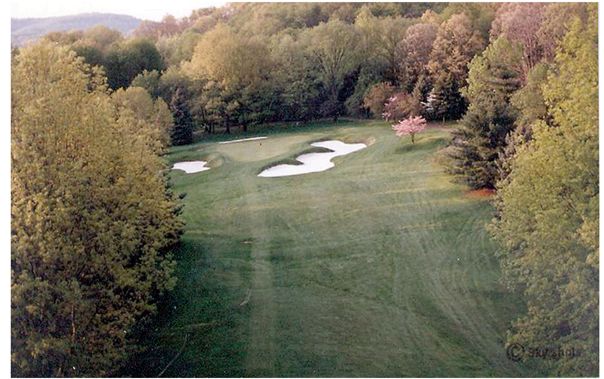
Trees continued to pinch hole 6 in 1983