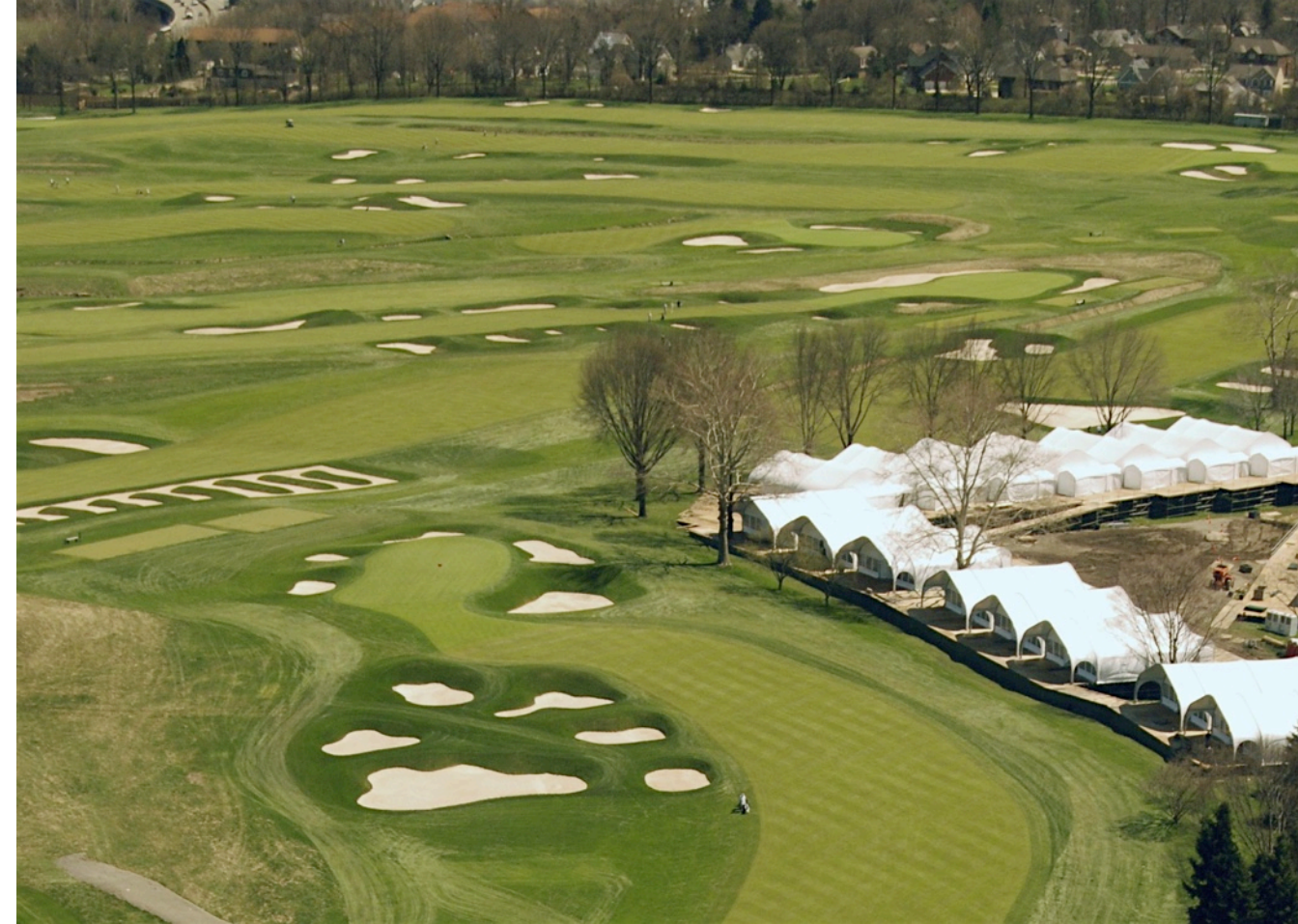
Hole 17 in 2007