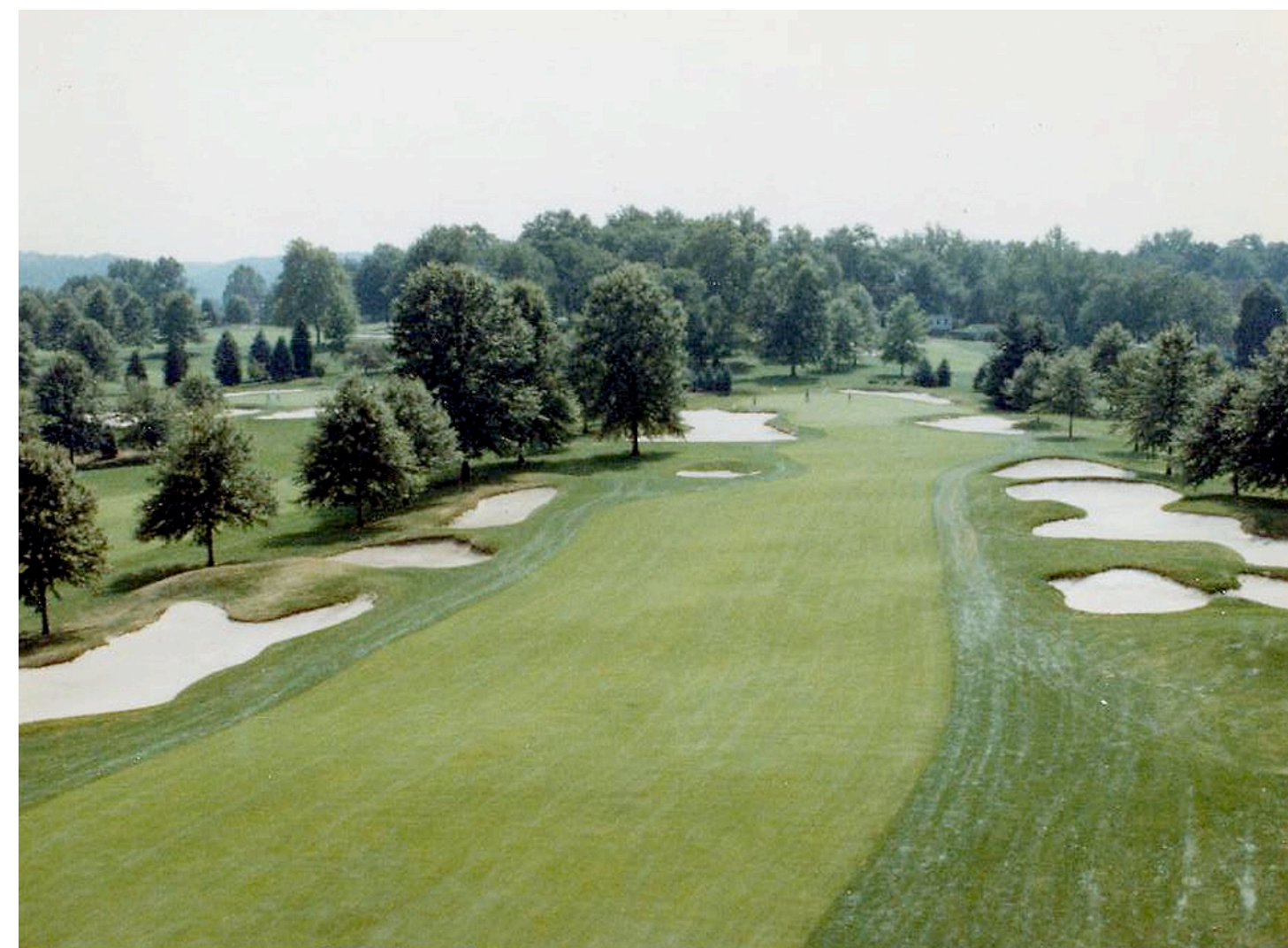
In 1983 tree plantings surrounded hole 14